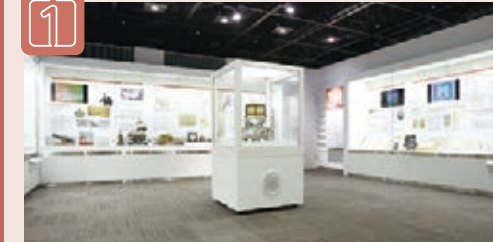
Room of the Founders

Here we introduce items related to our two founders, including Mechanical Figures, Perpetual Clock and Incandescent Lamps.